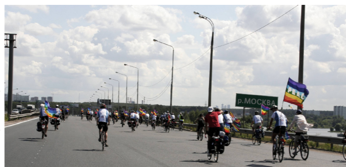
Arrival of the bike for peace ride in Moscow 26.7.2008

„What a world we could build, if the powers unleashed by wars were used for constructive purposes! A tenth of the energies, a fraction of all the money would be sufficient to help people of all countries to a dignified live and to prevent the disaster of unemployment.“ (Albert Einstein - 1932)